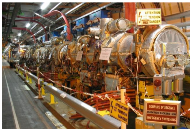
Figure 3: MKI system in LSS8R.

After the decision to increase the number of spares for the LHC injection kickers, two further magnets are presently under construction and should become ready for use in 2012, thus completing a full injection system comprising 4 magnets, Fig. 3.