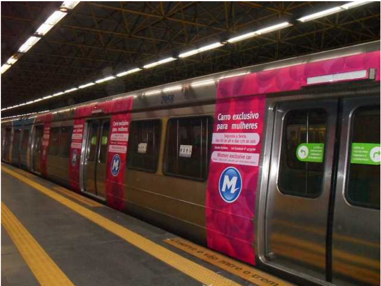
Women exclusive Car