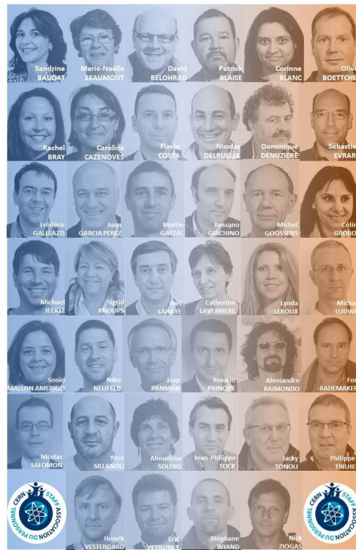
Vos délégués / Your delegates 2014-2015