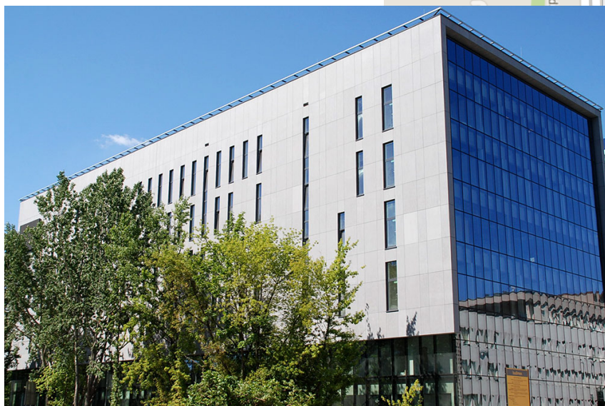
← View of the facade of the building