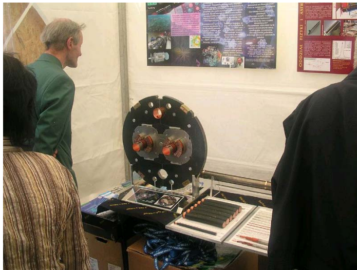
Meeting , CE