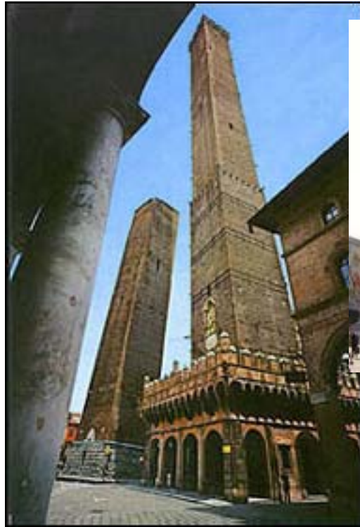
The two Towers