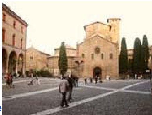
Le Sette Chiese