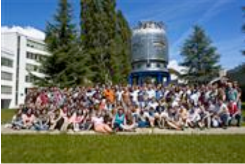
CERN summer students 2008