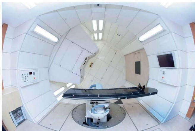
Hadrontherapy treatment room

ULICE is funded for four years by the European Commission with 8.4 million Euros and involves 20 European institutions coordinated by CNAO. All the existing and planned European ion therapy facilities are involved in the project, together with two research centres (CERN and GSI) and two industrial companies (Siemens and IBA). The experience being built up in Heidelberg, Pavia and Marburg will help the development of hadrontherapy in Europe (and globally) and will provide patients throughout Europe access to these centres with treatment according to standardized protocols. In addition, other centres planned in Europe which are due to start, will benefit from this experience.