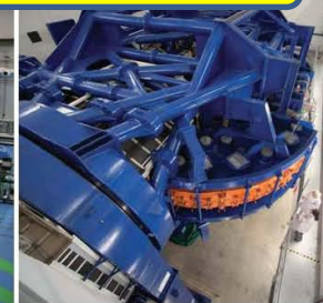
First rotating gantry for carbon ions weighing 600 tons