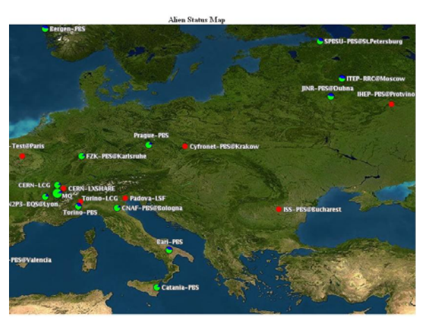
Figure 1. The map of AliEn sites participating in the Alice Physic Data Challenge.

Five Russian sites have been configured as AliEn clients of the ALICE virtual organization for the Physics Data Challenge at the non-LCG clusters. These clusters at the IHEP site in Protvino, at the ITEP site in Moscow, at the JINR site in Dubna, Kurchatov Institute in Moscow and St. Petersburg State University in St.Peterburg) could run a maximum of 111 jobs with total storage disk space equal ~4TB. The map of sites running PDC under AliEn standalone is presented in figure 1. Sites are operating in time of monitoring are marked by blue-green circles. At the Phase I of DC the JINR site was the most productive among the Russian sites. Presently daily operation of Russian site consist of ~9% of jobs running