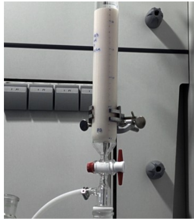
Al 2 O 3 purification column in Mainz