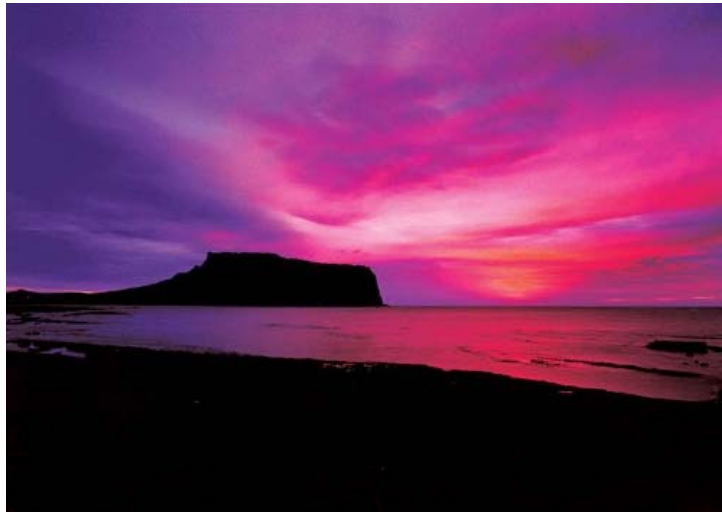
Seongsan Ilchulbong (Sunrise Peak)