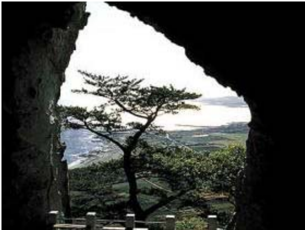
Sanbang Cave buddhist temple