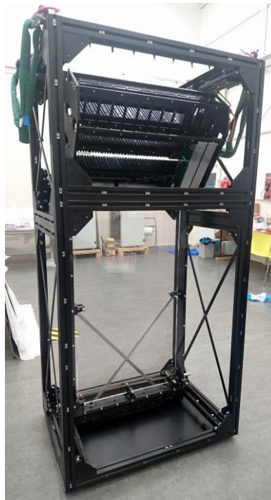
Figure 2 TORCH Prototype Detector