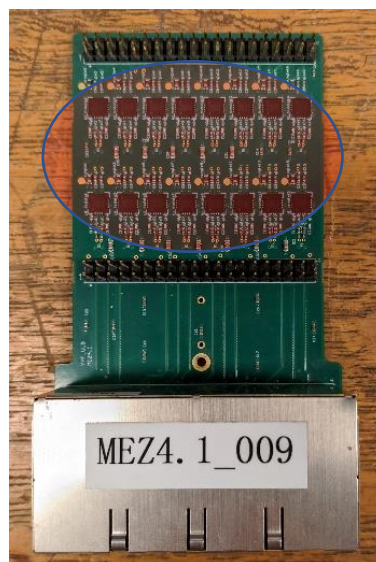
Figure 3 : One Mezzanine with 16 equalizers (red circle)