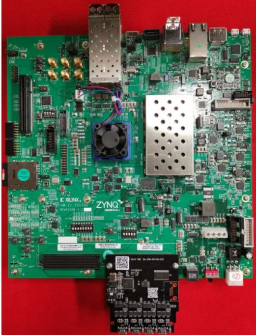
Figure 1: RCE bench-top system: ZCU102+FMC

Front: 10G optical fiber to back-end DAQ system