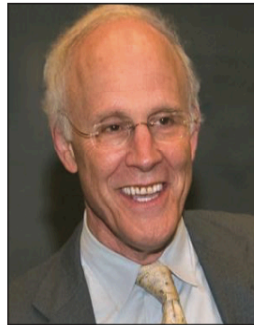
David J. Gross 2019 APS President