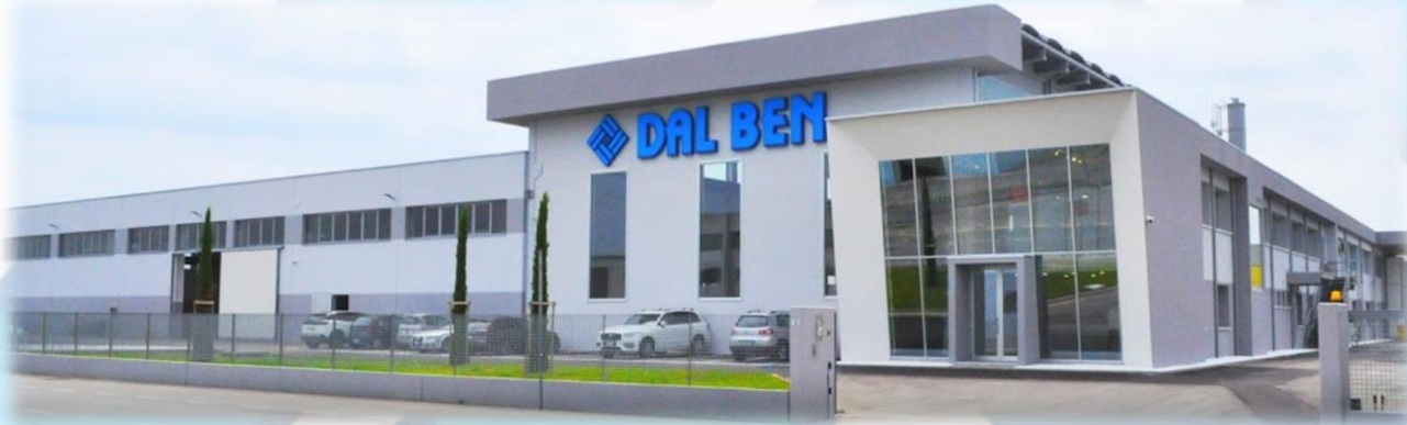
San Stino Di Livenza (Italy)