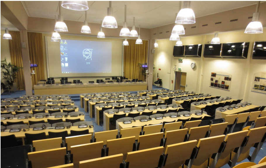
Council Chamber, 503/1-001