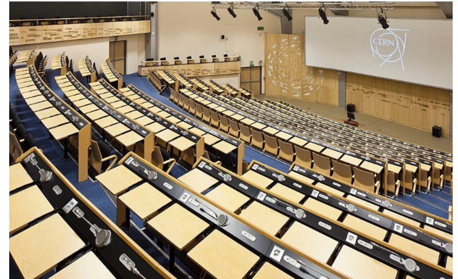
Main Auditorium, 500/1-001