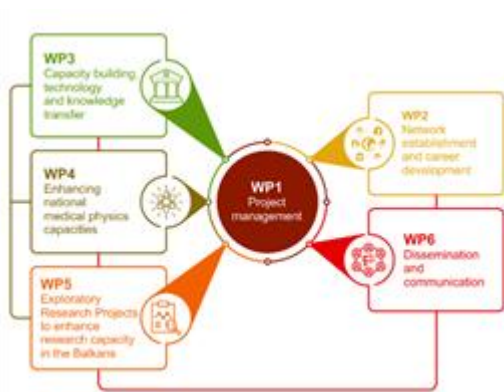
Figure 3. Graphical representation of how WPs are interconnected