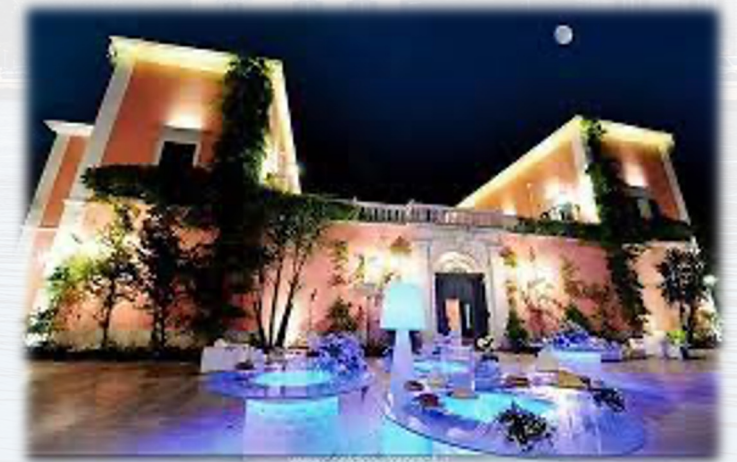
Villa Ciardi (Bisceglie)