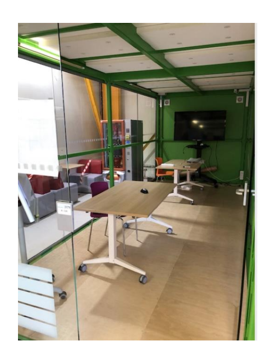
Figure 3 - One of the 14 m<sup>2</sup> offices, with 2 working places.

Room 1/C05 is an office for {\bf 1} person and it cannot be used as corridor (blocked on one side).