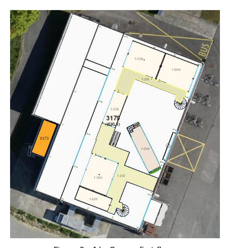
Figure 2 - IdeaSquare first floor.