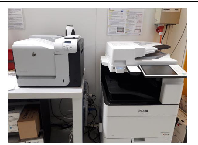
Figure 4 - The common printer of IdeaSquare.