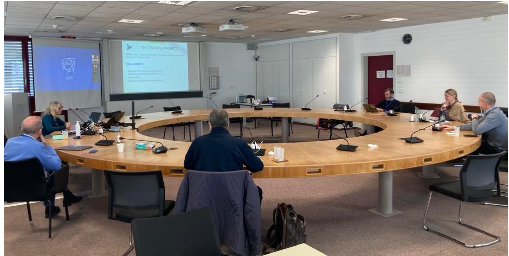
HEPTech's future meeting at CERN