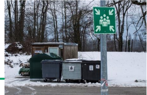
Jura side: close to picnic area

In case of evacuation alarm, leave immediately the building and go to the assembly point!