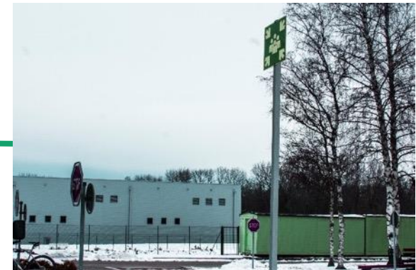
Salève side: car park by the ramp, close to building 892