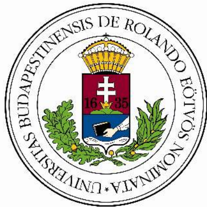
Eötvös Loránd University