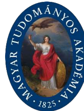
Hungarian Academy of Sciences