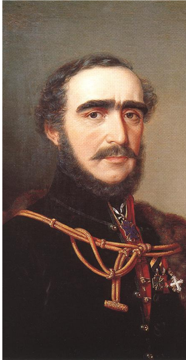
Miklós Barabás: Count István Széchenyi (1848)