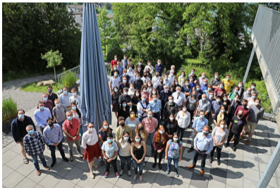
CHIPP Plenary meeting 2021 in Spiez