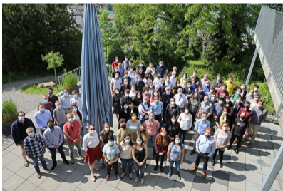
CHIPP Plenary meeting 2021 in Spiez

[...] regrouping all the particle, astroparticle, and nuclear physicists holding a Master in physics and working for a Swiss institution , as well as the Swiss PhD nationals working at CERN .