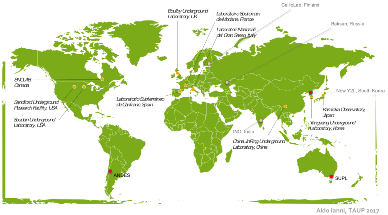
Figure 1: Map of existing (yellow dots) and planned (red dots) DUL over the world [44].