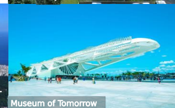
Museum of Tomorrow