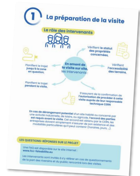
Guide for measurement campaigns