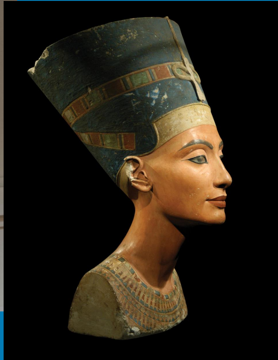
Bust of Nefertiti, Berlin