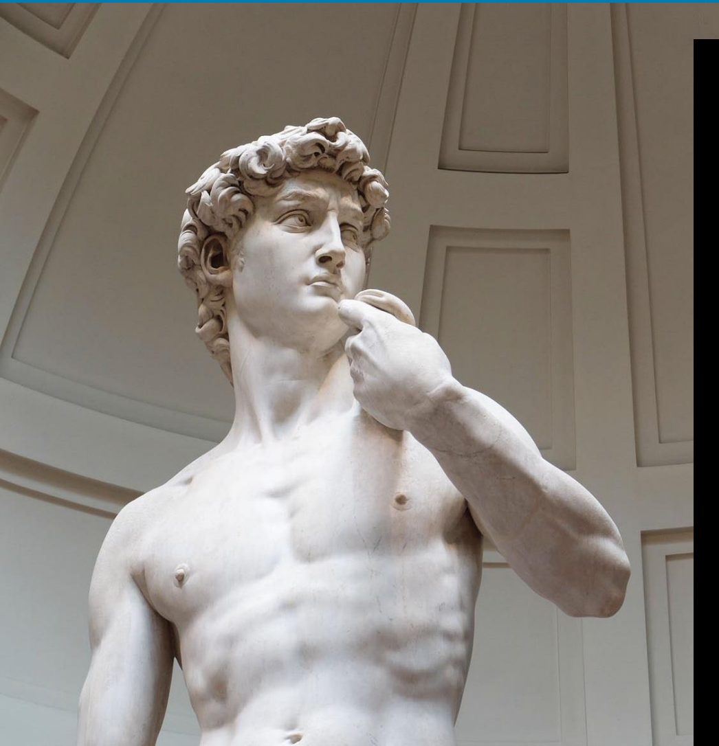
Michelangelo's David, Florence