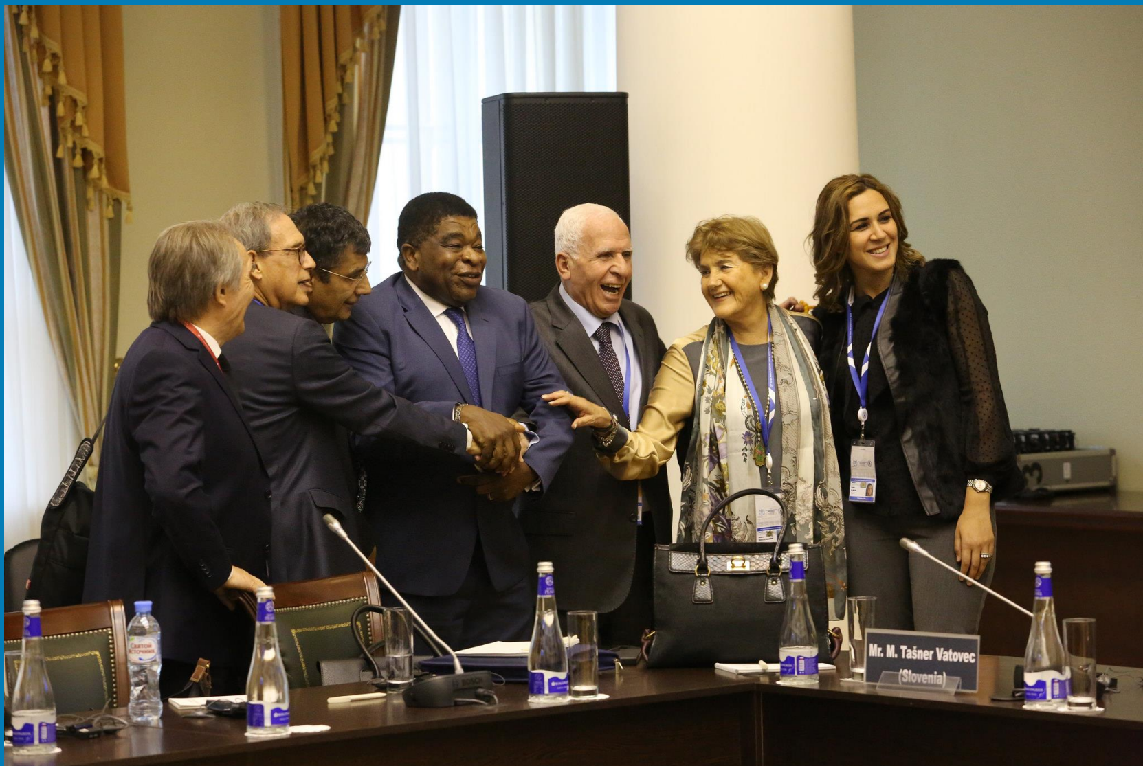
IPU Assembly - Middle East Committee, Science for Peace Schools, October 2017