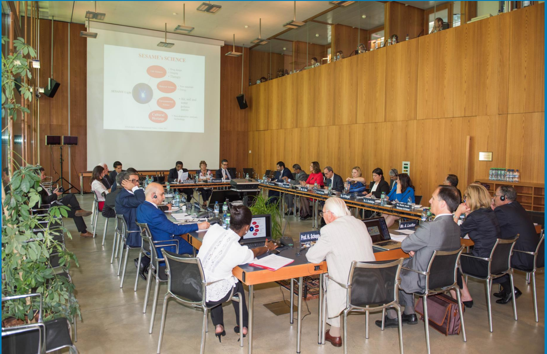
SESAME at the 2 nd IPU Roundtable on Water in the Middle East, July 2017