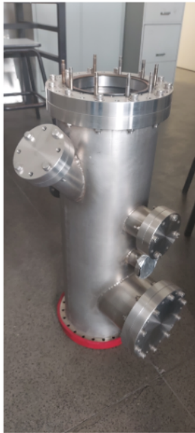
Figure 1: Picture of the hull of the tube

It is relevant to note that this project was underway until the Covid pandemic put a stop to it. Therefore, there is previous groundwork already developed, and that is still to be studied.