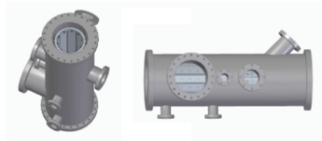
Figure 3: Computerized sketch of the hull of the tube.

The vessel planned to be used in this project has been measured and modeled using a computer aided design software.