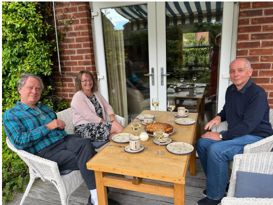
The photographer in the window. 9/22