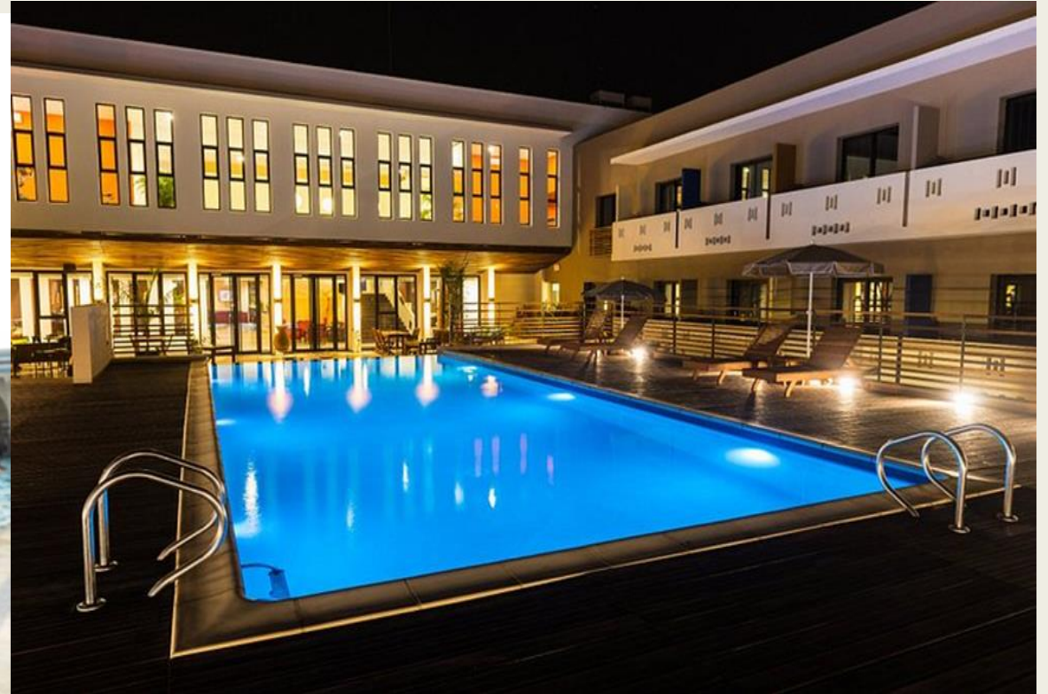
The ONOMO Hotel