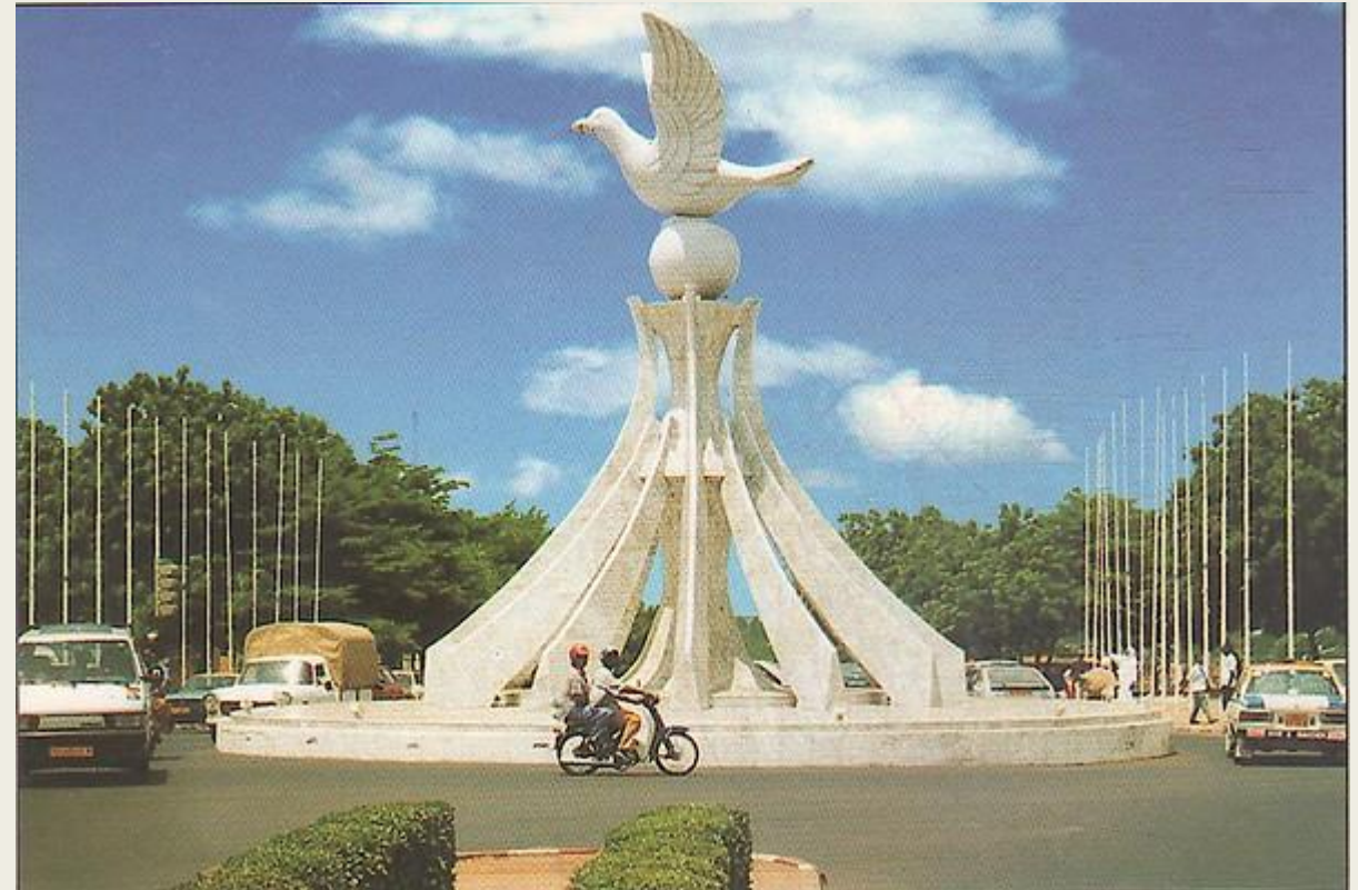
Colombe de la Paix