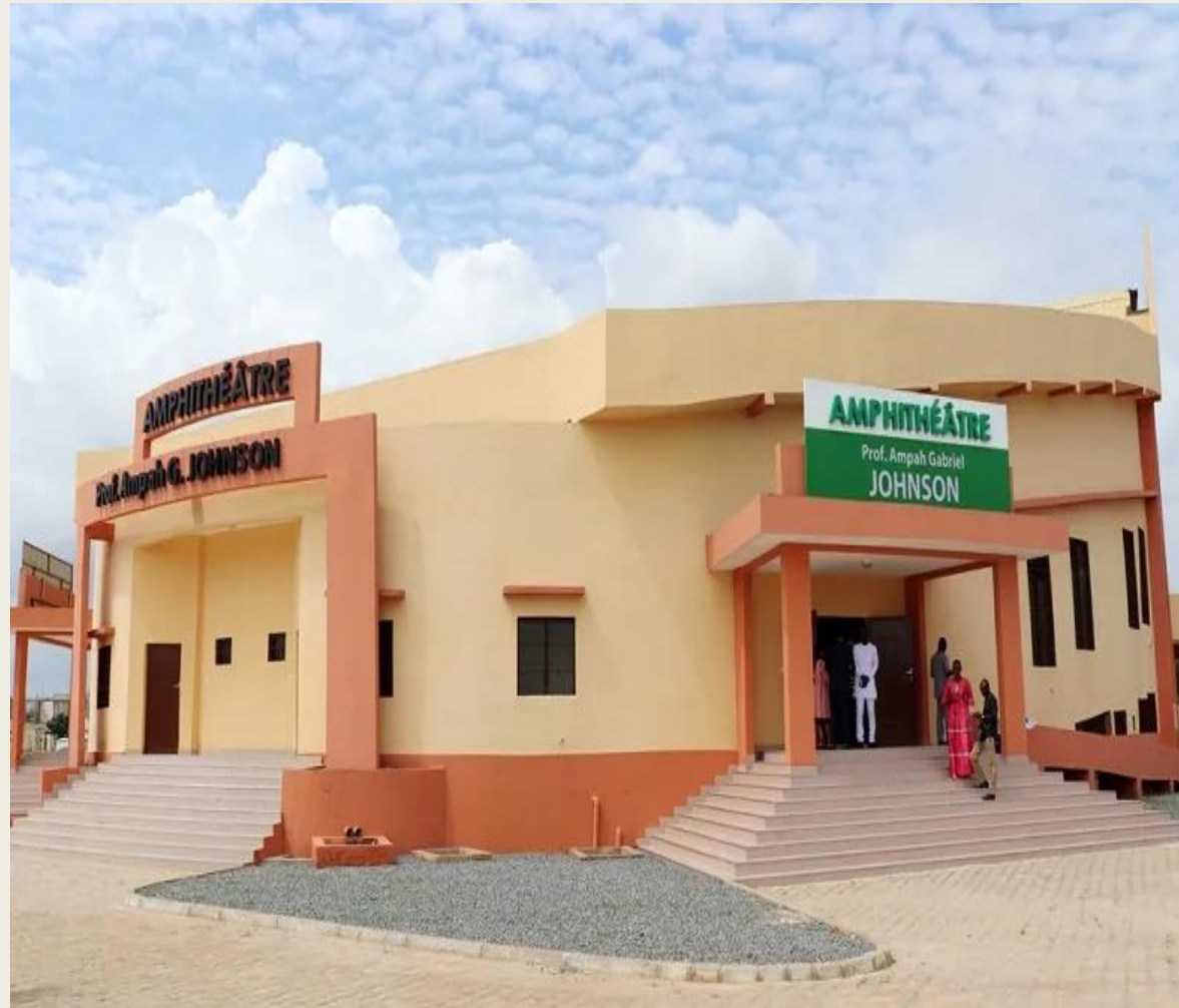
The Amphitheater of 1,500 places