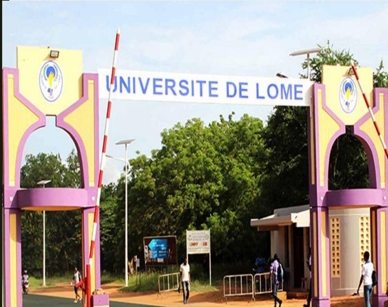
Entrance of UL