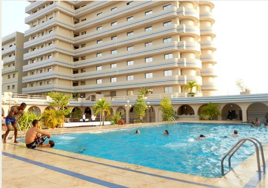
The EDA-OBA Hotel