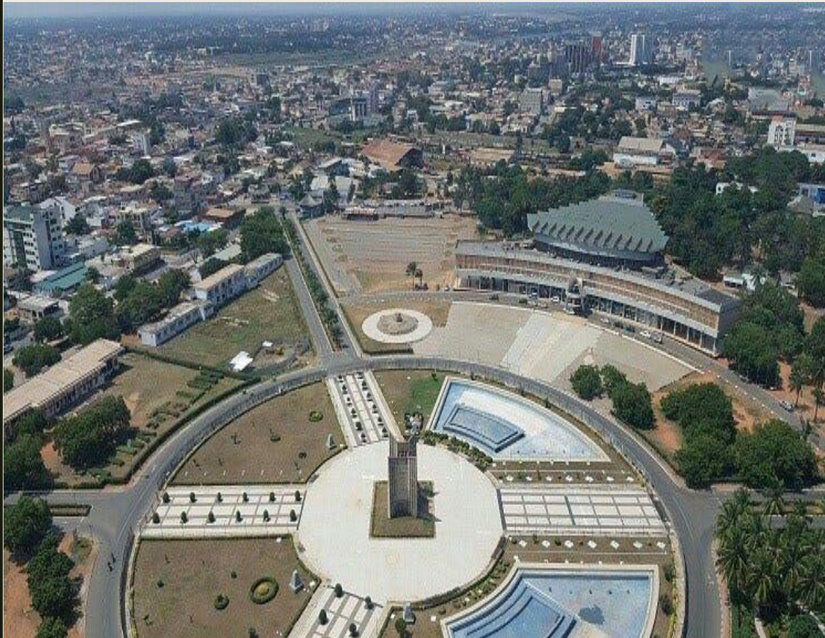
Lomé by the day