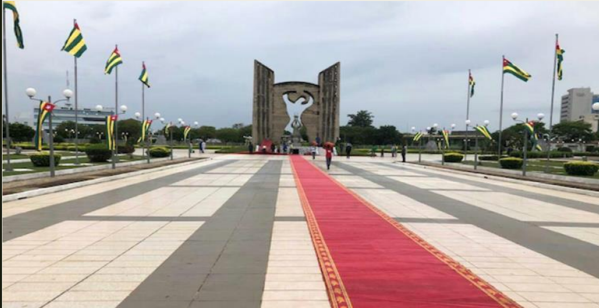
Place of Independence