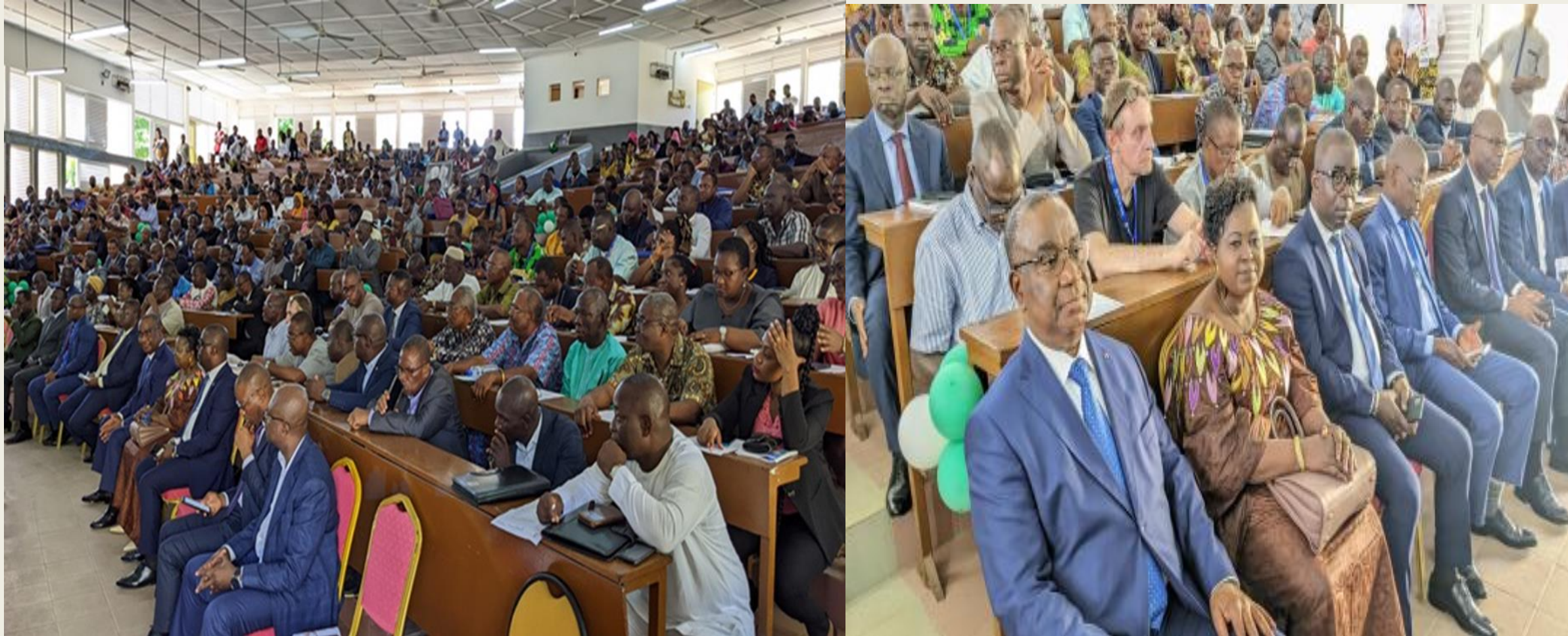
Previous scientific manifestation photo