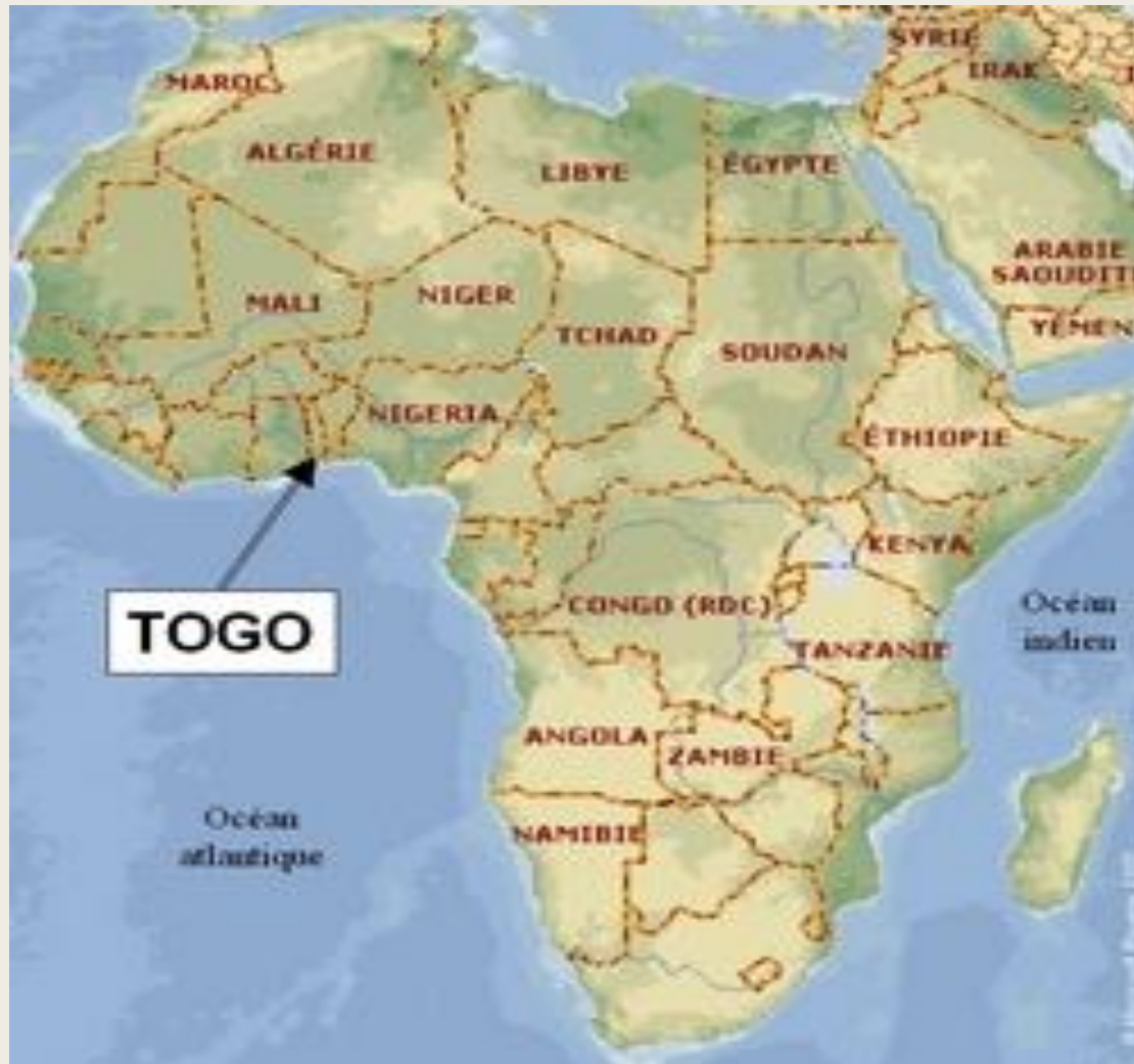
Position of Togo on Africa map