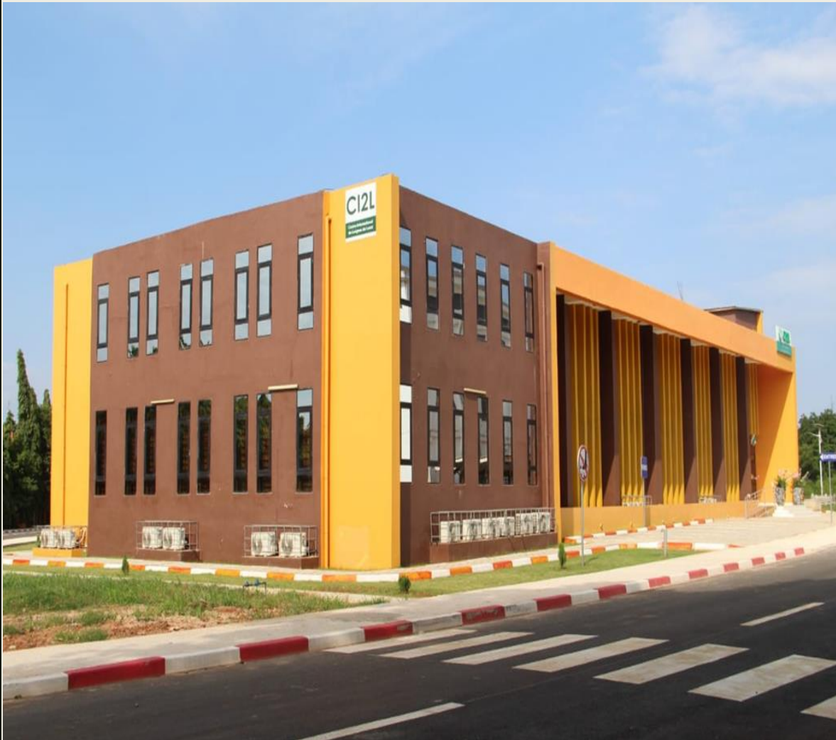
English language center