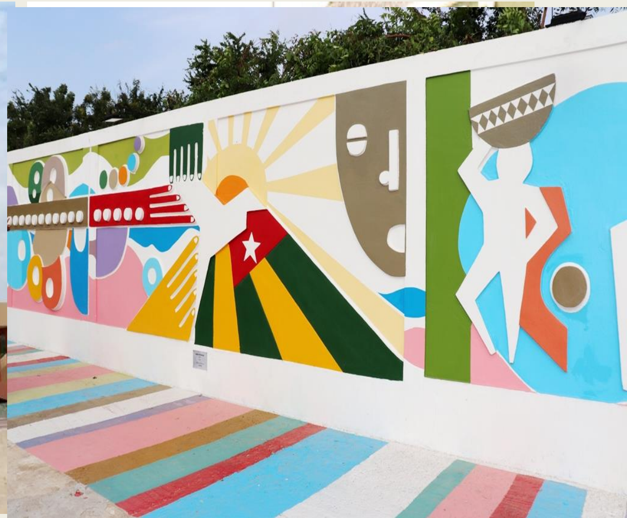
wall frescoes of UL