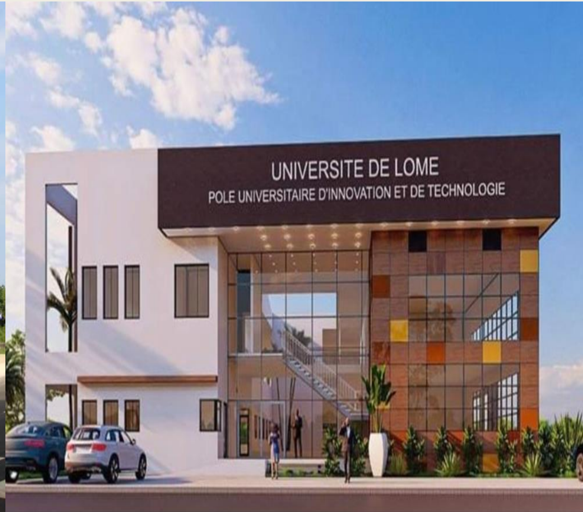
Innovation Tech building