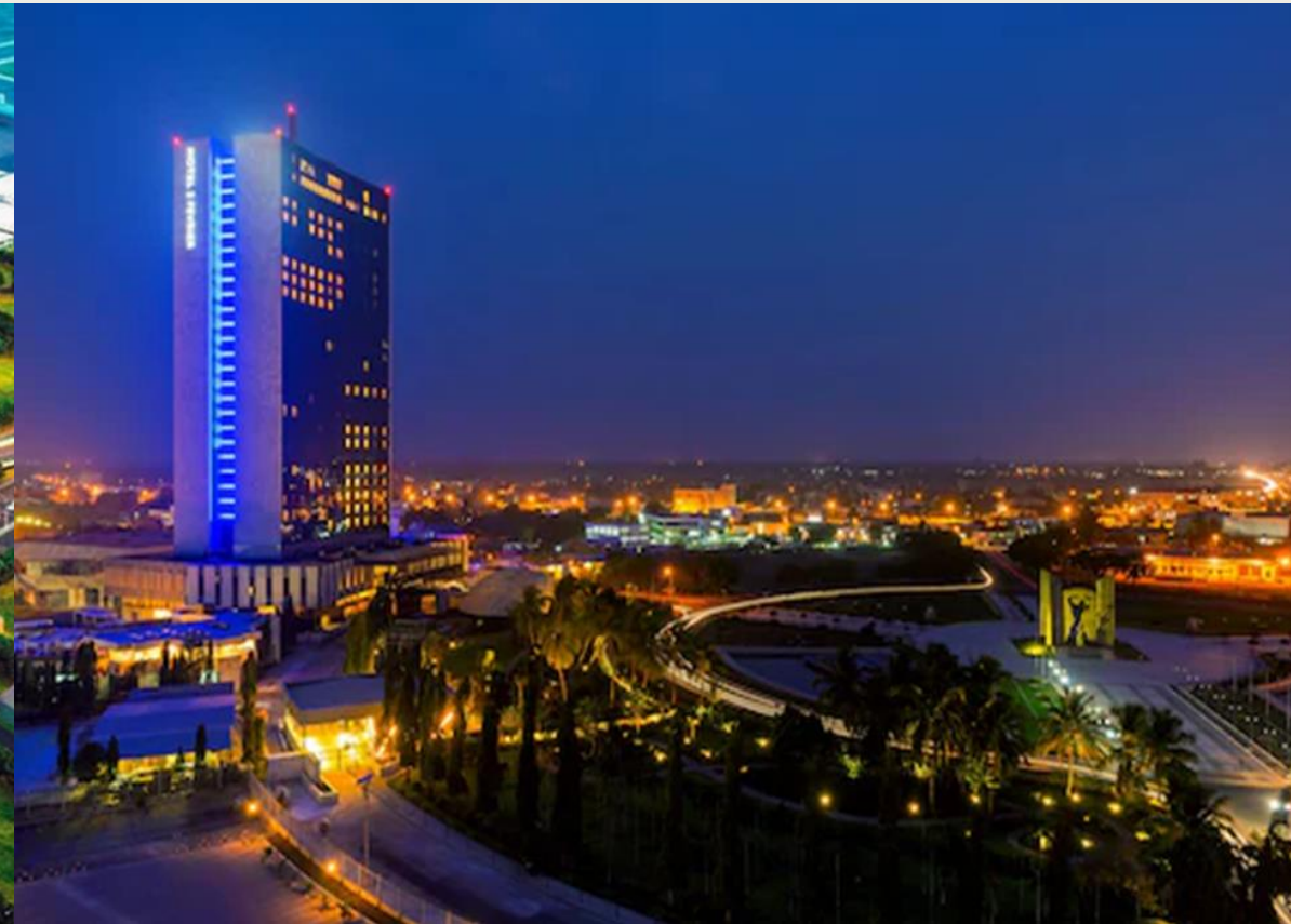
Lomé by night with the 2 Fevrier Hotel