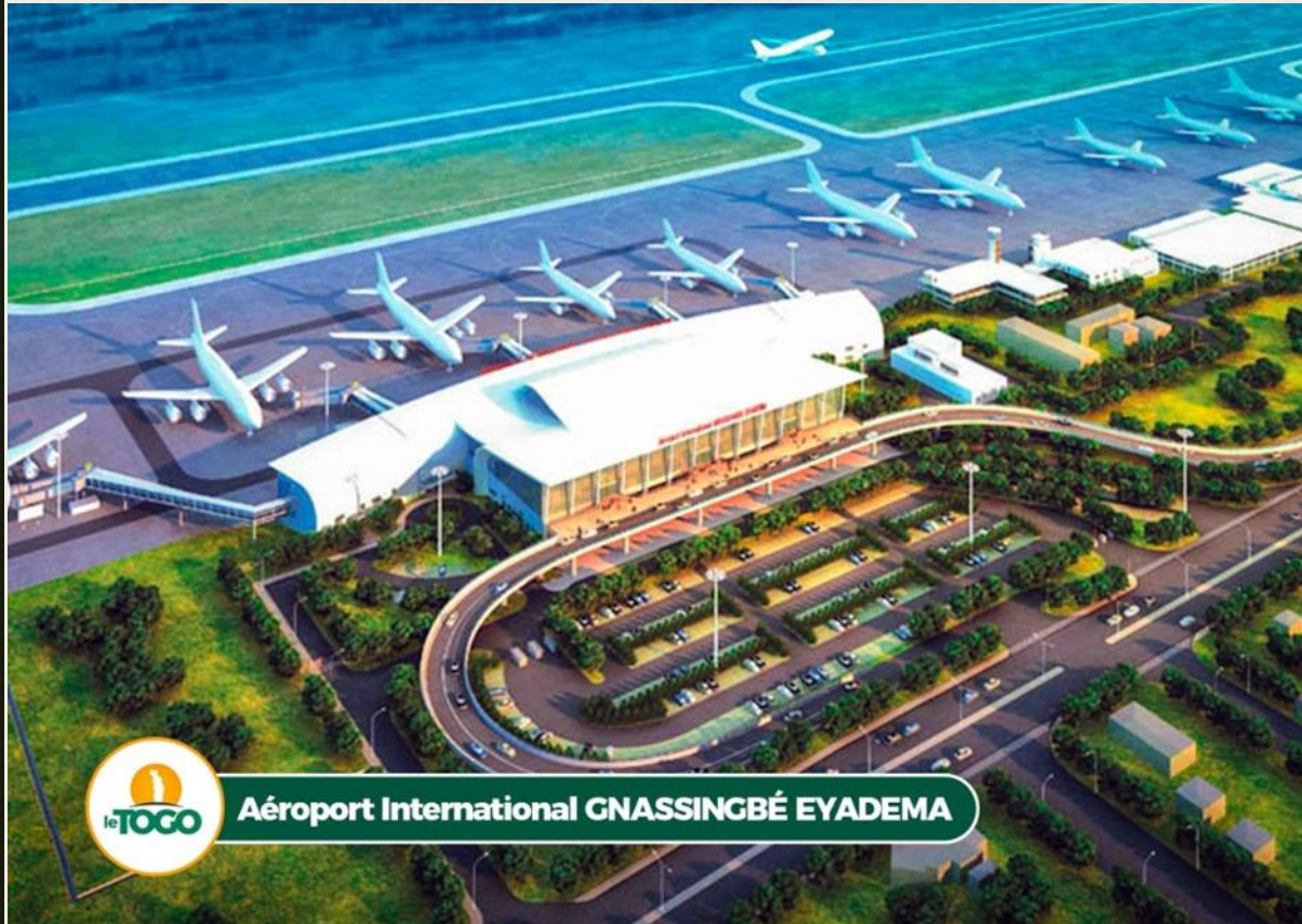
Lomé International Airport