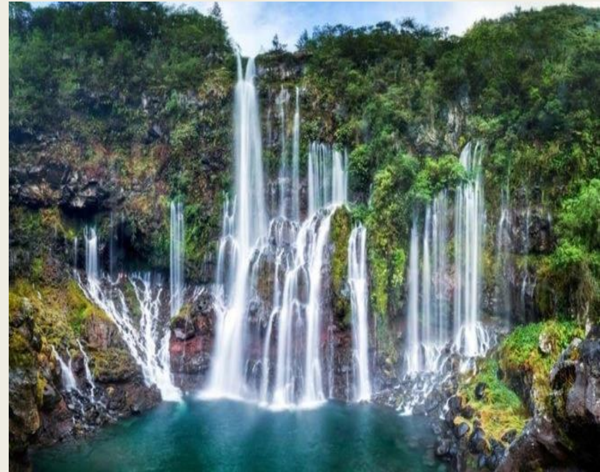
Waterfalls OF TOGO