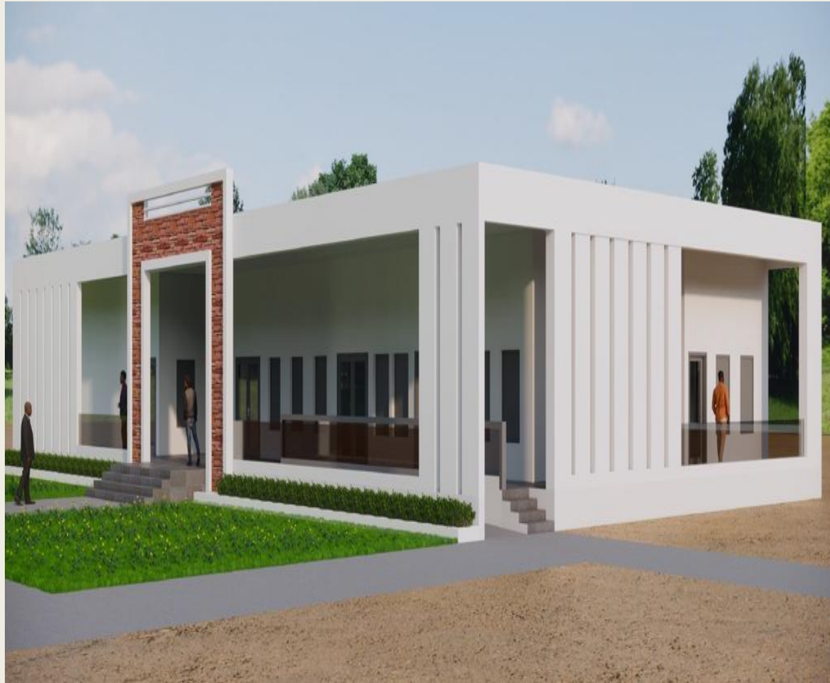
Climate change building