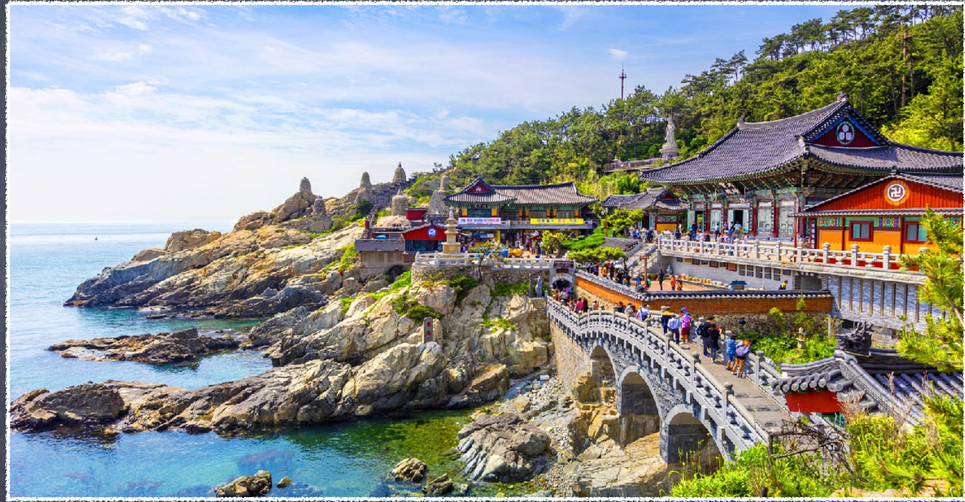
Haedong Yonggung Temple