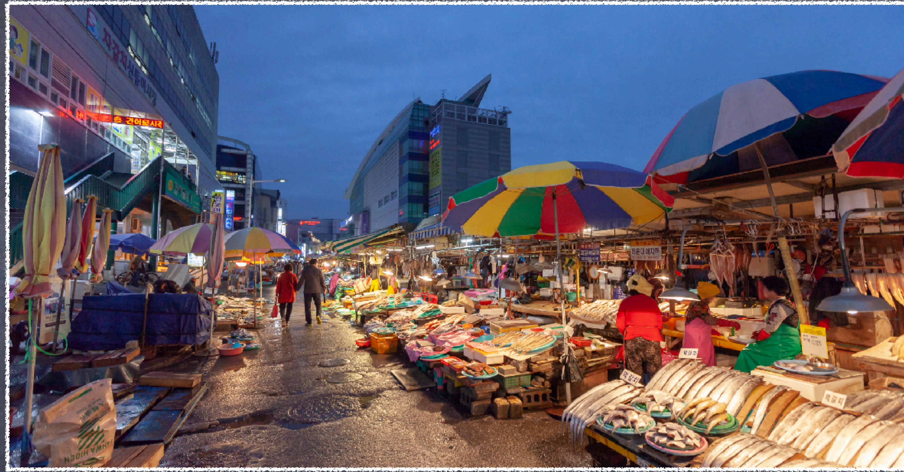
Fish market: Busan Jagalchi Market