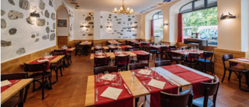
Cave Valaisanne Chalet Suisse