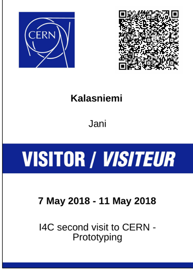
Figure 1 Example of a CERN visitor card

Here is an example of what your visitor card should look like: