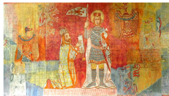
Charles IV brings the founding document of the university to St. Wenceslas.