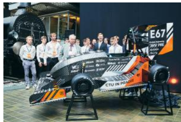
Autonomous electroformula car by CTU students.