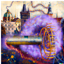
DALL-E: Particle physics experiment and Prague, painting.