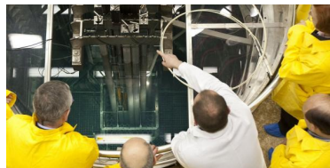
Small fission reactor used for education.