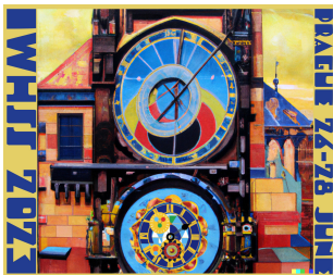
DALL-E: a cubist painting of the Prague astronomical clock.