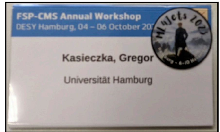
Fancy #ML4Jets badge