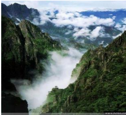
Yellow mountain (250 km south of Hefei)