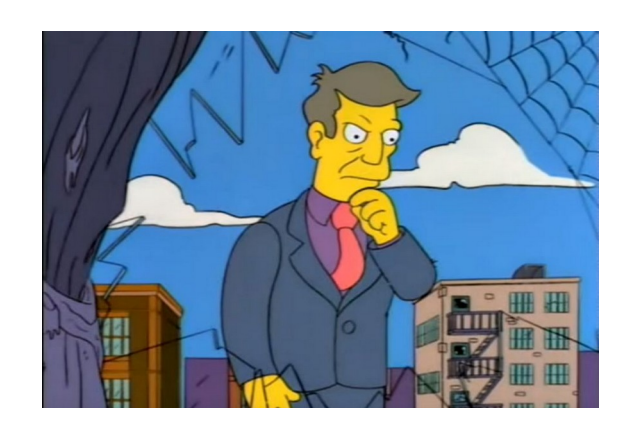
Am I So Out of Touch?