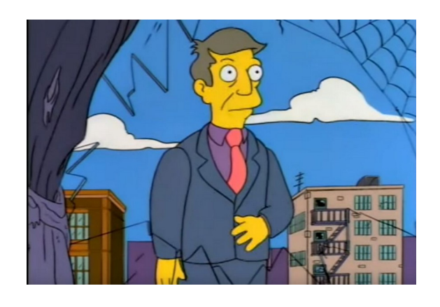
No, its the children who are wrong.