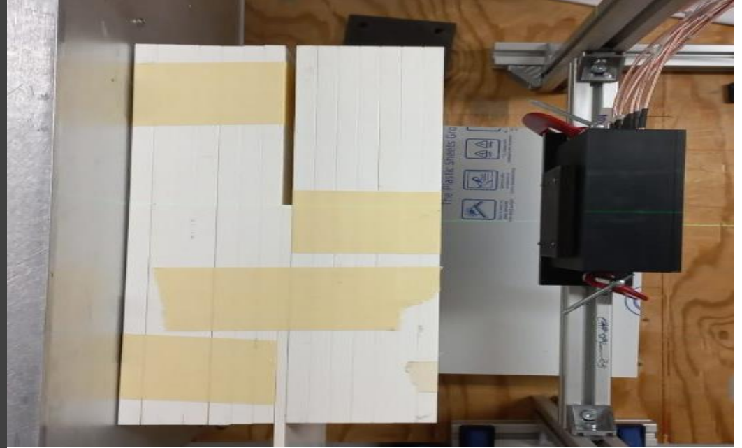
Water-equivalent phantom with an air gap of 5 mm.