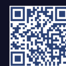
Complete agenda here!