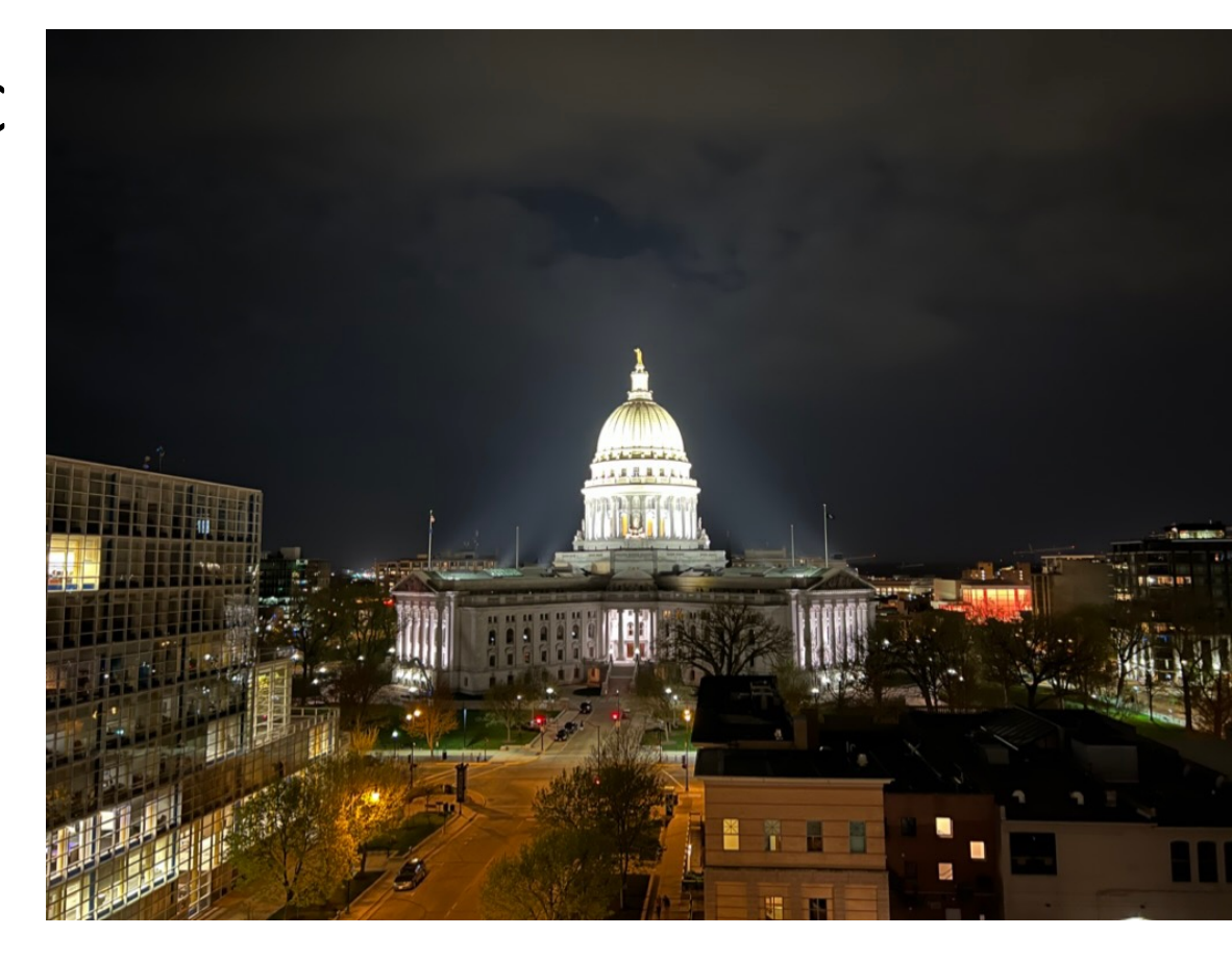
While there, make sure to catch a view of the capitol building!