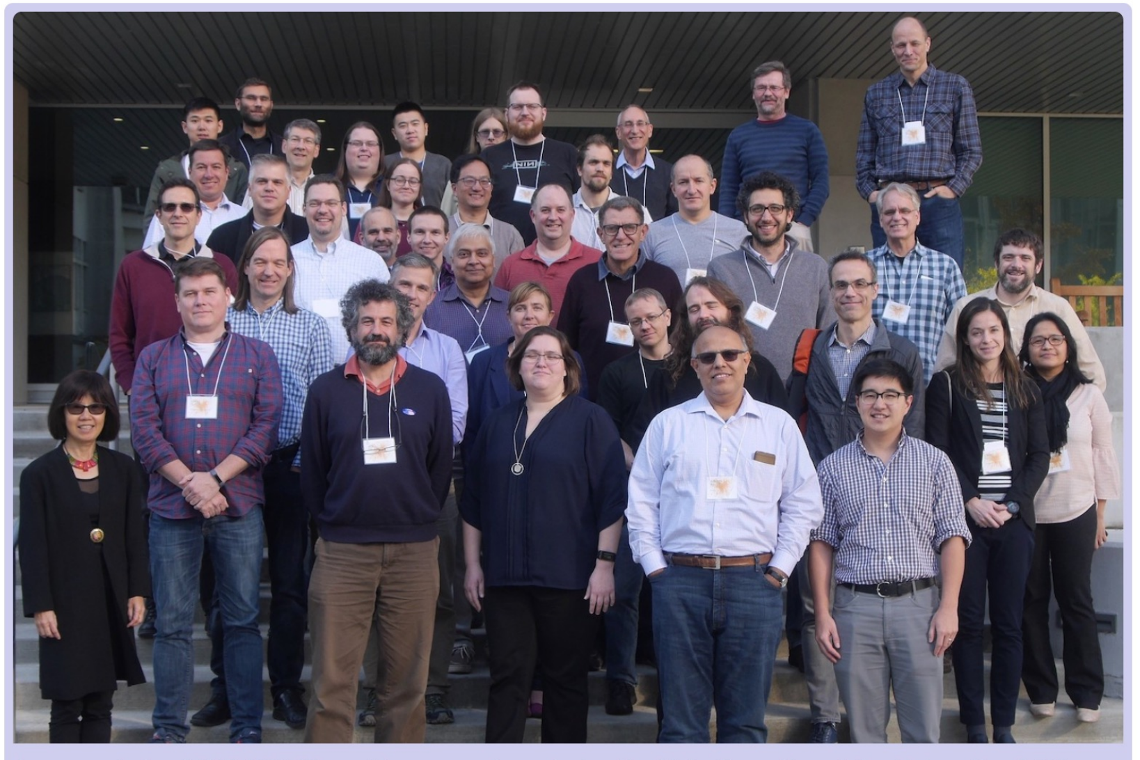
A group photo of IRIS-HEP PIs and team members during the kickoff meeting at the University of Chicago on October 31 - November 2, 2018