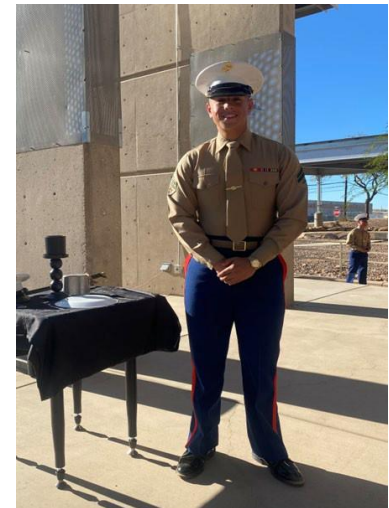
Area Facilities Manager Infrastructure Services Division Hired 2023