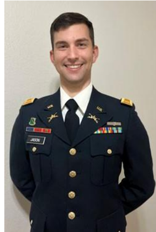
Financial Analyst Finance and Procurement Hired 2023