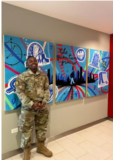
Cybersecurity Specialist Accelerator Directorate Hired 2023