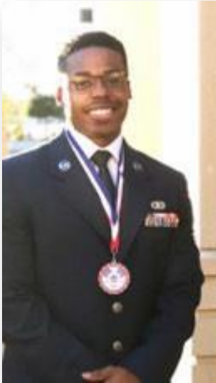
Small Business Liaison Officer Finance and Procurement Hired 2023