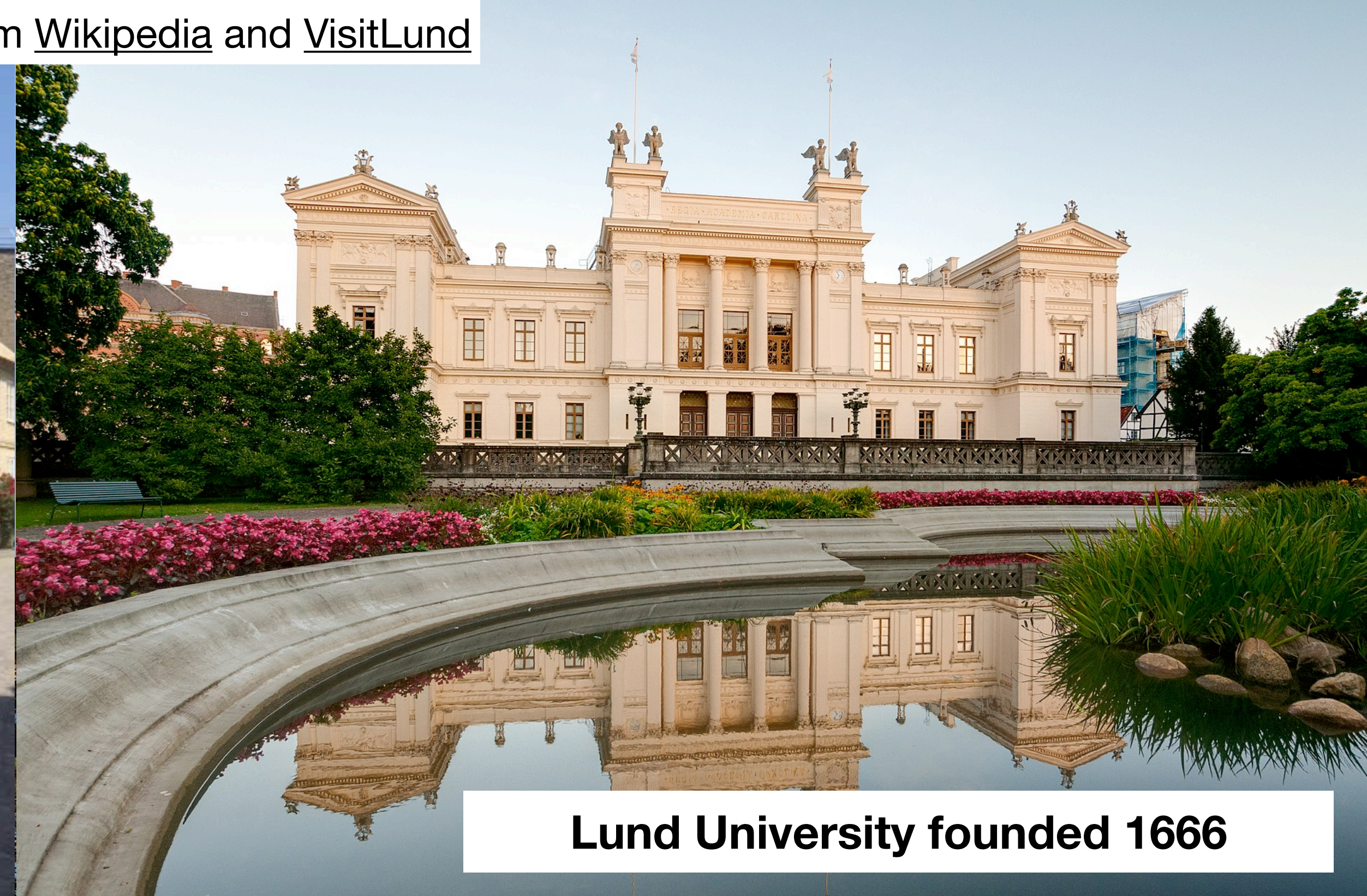
Lund University founded 1666