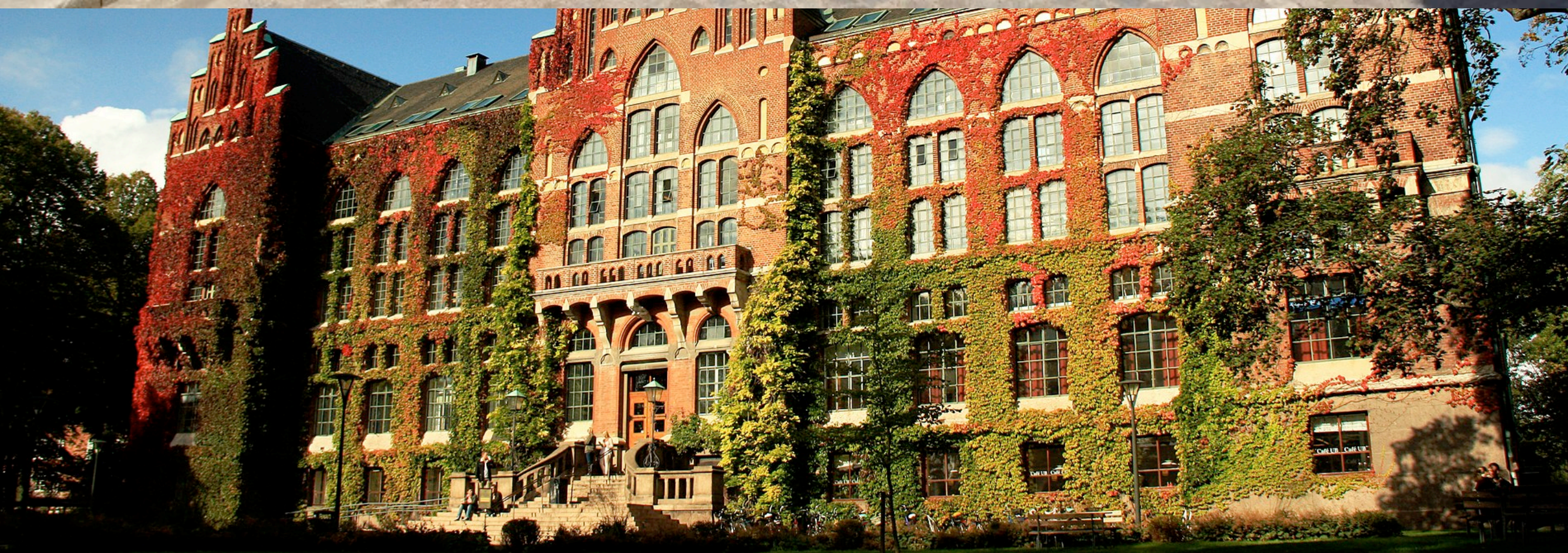
Lund University Library