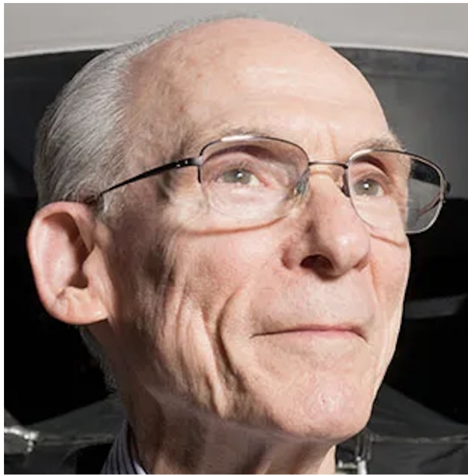
Prof. Edward Carroll Stone (January 23, 1936 – June 9, 2024) 88 years