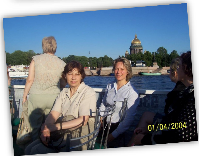
Visit of Mara to SPb