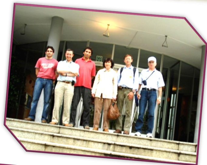
INTAS-CERN TOSTER workshop, 2008, SPb, Ioffe Institute