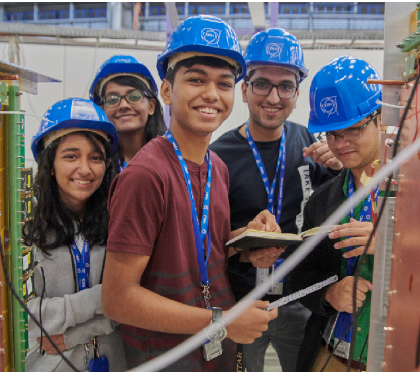
Beamline 4 Schools