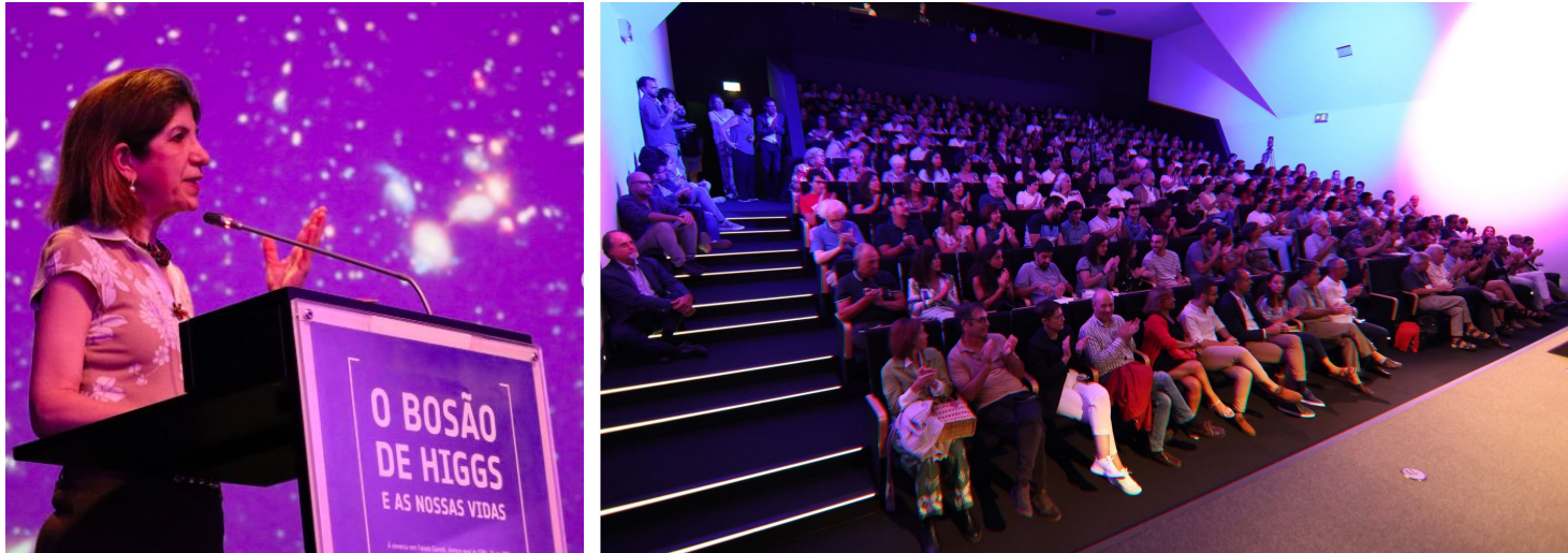
Public session at the Clência Viva Science Centre “Pavilion of knowledge”, in Lisbon. “The Higgs boson and our life” by Fabiola Gianotti

September R-ECFA visit to Portugal + public session with Fabiola Gianotti