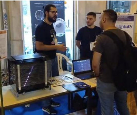
LIP spark chamber!

LHC (Ciência Viva Science Center) Cosmic rays (Science Museum), Health applications (Champalimaud Foundation)