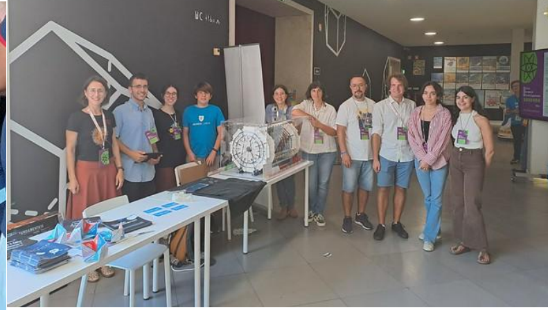
Large ATLAS+CMS support team