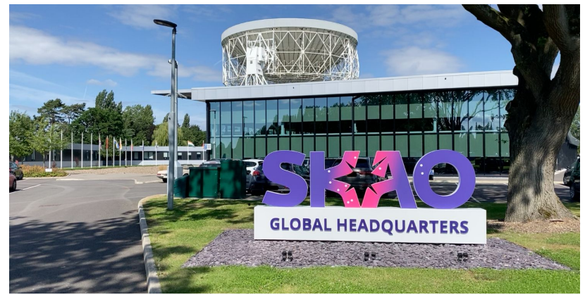
SKAO, HQ, Jodrell Bank, Cheshire, United Kingdom