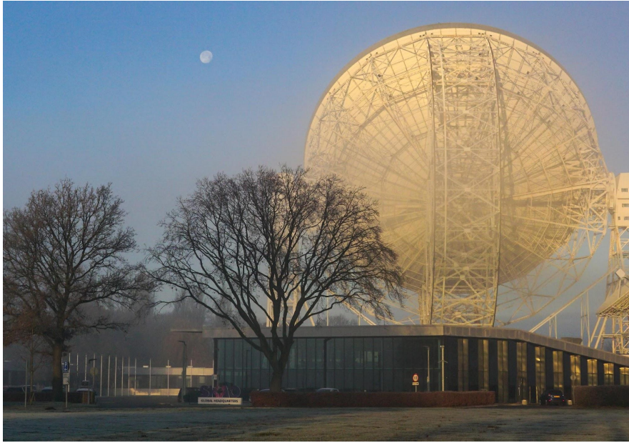
Jodrell Bank, UK