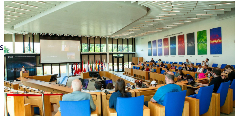
Council Chamber, SKAO HQ, Cheshire, United Kingdom