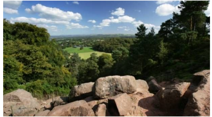
Alderley Edge countryside, United Kingdom