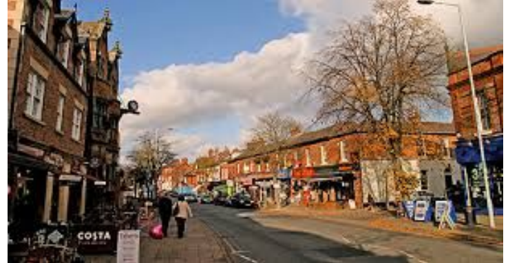
Wilmslow, Cheshire, United Kingdom