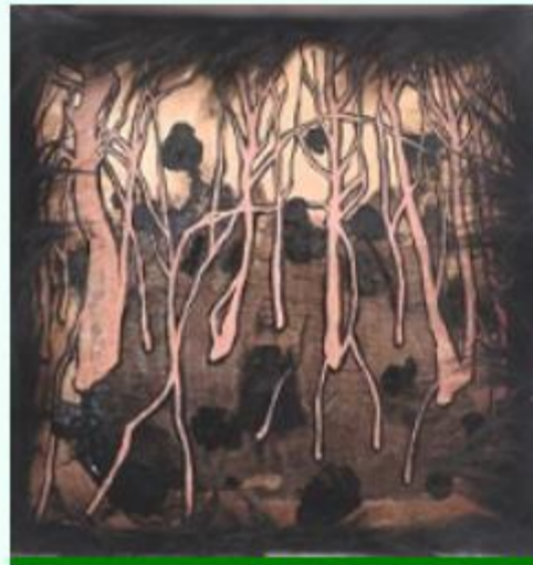
A. Gáspár: Calculate the Entropy XIV

23rd ZIMÁNYI SCHOOL WINTER WORKSHOP ON HEAVY ION PHYSICS