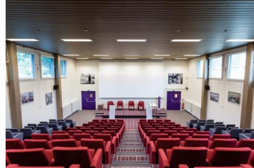
Small auditorium: 100 seats, Zoom (500 meters from other rooms)