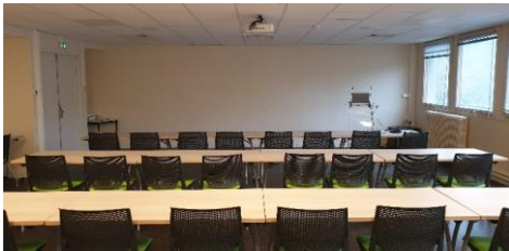
Meeting room: 35 seats, Zoom