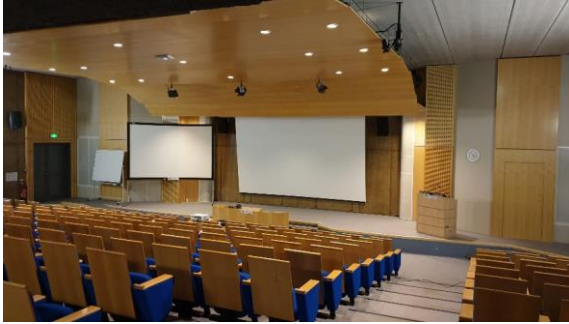
Main auditorium: 250 seats, Zoom